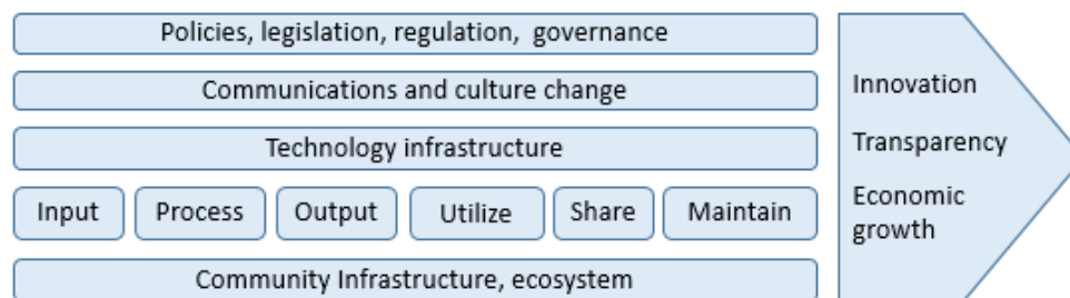
Figure 1: Data Value Chain (based on [20])

approach considers the context and the processes of transforming components of data into valuable information to be used for some end.