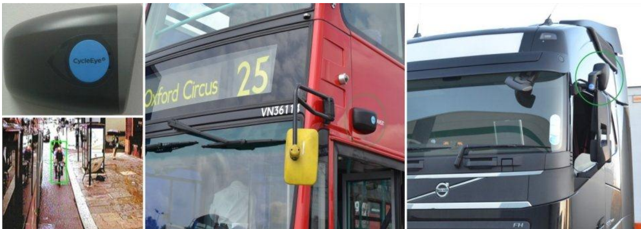
Figure 2: CycleEye – Collision Avoidance [6]

CycleEye app, a collision avoidance system developed by Fusion Processing, aims to alert drivers of buses, coaches and cargo carriers regarding the existence of a bicyclist in the proximity of their vehicle, thus helping to avoid an accident. The technology is based on camcorders placed outside of large-sized cars, cycling sensitive cameras – in other words, it identifies the bicyclist, with great accuracy, from the rest of the traffic participants [6].